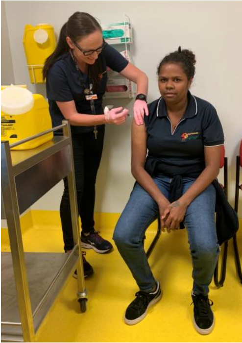
Maari Ma staff ensure their own flu vaccination status is up to date to help stop the spread of the flu and protect vulnerable clients.

Maari Ma staff are committed to ensuring clients are protected from the influenza virus and this year vaccinated more clients to the beginning of July than were vaccinated last year over all. Staff know it's important for as many well people to be vaccinated as possible in order to protect the most vulnerable who can't be vaccinated, such as babies under six months of age. Staff have been encouraging clients, family and friends to get their flu shots with higher than normal rates of influenza infections in Broken Hill and increased presentations at the clinic.