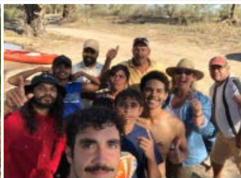
Wilcannia participants of the Certificate 2 in Tourism course on field visits.